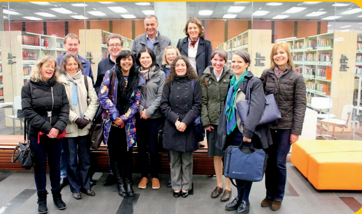
EMLEX CONSORTIUM 2016, KATOWICE