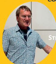
Erasmus Mundus coordinator