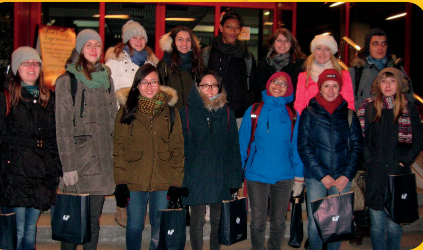
SAMUEL-LINDE COHORT 2016-18, KATOWICE

THE COURSES WILL BE HELD IN THE UNIVERSITY ORGANIZING SUMMER TERM ▶