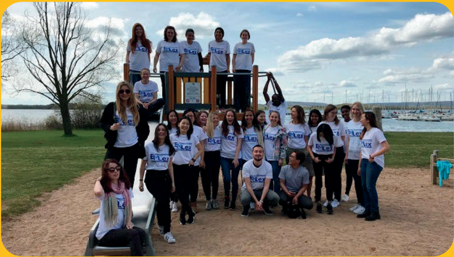
IGOR-MEL'ČUK COHORT 2017-19, NONSARD

Third Semester IMPROVING LEXICOGRAPHICAL SKILLS