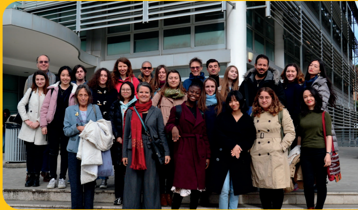
TULLIO-DE-MAURO COHORT 2018-20, ROME